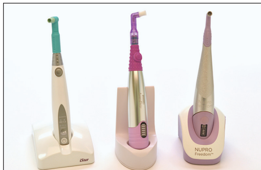
Figure 7. Several examples of cordless prophylaxis handpieces in their charging bases (left: iStar Cordless Prophylaxis Handpiece [DentalEZ] and Pivot Disposable Propyl Angle [Preventech], center: AeroPro Cordless Propyl Handpiece System and 2pro Disposable Propyl Angle [Premier Dental Products], right: NUPRO Freedom Cordless Propyl System and NUPRO Freedom Slim Disposable Propyl Angle [Dentsply Sirona]).