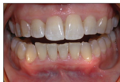
Figure 4. Following stain removal, the clinical appearance is much improved. Note the absence of trauma to the marginal gingiva.