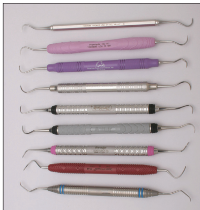
Figure 2. A variety of dental hygiene instruments demonstrates the trend away from small-diameter handles toward larger-diameter, textured handles. From top to bottom, the instruments are the Premier scaler H6/H7 (Premier Dental Products), PremierAir scaler H6/H7 (Premier Dental Products), American Eagle EagleLite Resin Scaler H5-33 (American Eagle Instruments), American Eagle EagleLite Stainless H6-7 (American Eagle Instruments), Hu-Friedy DE Scaler H6/H7 (Hu-Friedy), Hu-Friedy DE scaler ResinEight H6/H7 (Hu-Friedy), Hu-Friedy Nevi Posterior EverEdge (Hu-Friedy), PDT R144 Queen of Hearts (PDT), and Nordent DuraLite ColorRings CESC135 (Nordent Manufacturing).

nerve. 8 Additional strategies noted by another author include using sharp hand instruments to decrease needed force, adequate finger rests, using textured grips to reduce pinch strength, reducing cord pullback or tubing torque, and frequent stretch breaks 10 (Figures 1 and 2). Currently, the ADA has a webpage devoted to “Reducing Hand Pain” and lists examples of motions that may aggravate hand pain and tips for lessening the demands of the hand. 14