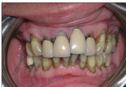
Figure 5. A patient with a severe stain who, because of restorations and an exposed root surface, is not appropriate for air polishing. Conventional rubber cup polishing is recommended.