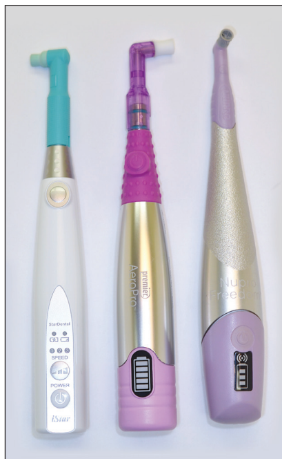
Figure 8. Several examples of cordless prophylaxis handpieces (left: iStar Cordless Prophylaxis Handpiece [DentalEZ], center: AeroPro Cordless Propyl Handpiece System [Premier Dental Products], right: NUPRO Freedom Cordless Propyl System [Dentsply Sirona]).

the same level of care while decreasing the amount of time hand muscles are in use? Alternating hand instrumentation with ultrasonic instrumentation is a first step, but an additional approach could be re-evaluating the routine nature of coronal polishing as a part of the prophylaxis procedure.