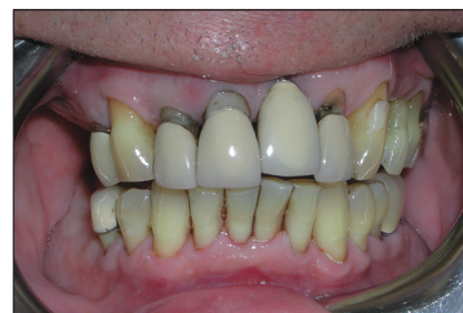
Figure 6. After the rubber cup polishing and complete stain removal.

hygiene treatment usually involves both hand and ultrasonic instruments, it is recommended that a combination of both techniques be used. In doing so, the duration of either technique is decreased, which can help to vary hand positioning, reduce muscle workload, and provide intermittent rest to hand muscles—specifically those involved with pinch force. 10