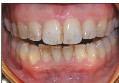
Figure 3. An otherwise healthy patient with a severe extrinsic stain. In this case, either rubber cup polishing or air polishing is appropriate.

The use of ultrasonic hygiene instruments has been reported as a means to decrease pinch force and reduce procedure time. 22 However, the vibration of ultrasonic instruments may still be a risk factor of MSD and CTS. 10,17,21,23 Because effective